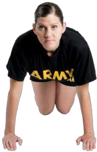
Hands and Knees Buttocks Stretch Starting position