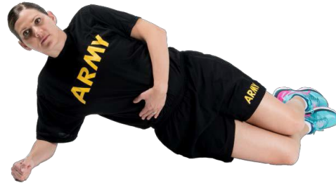
Modified Side Bridge Left Side Hold position