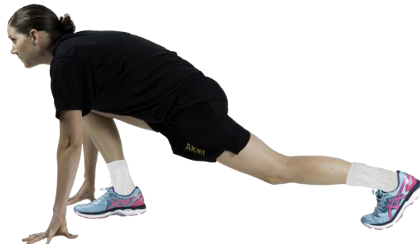
Count two – step back with left leg