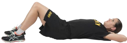
Curl Up Starting position