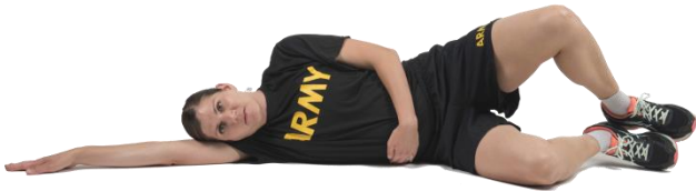
Count one & Count three