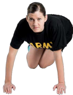
Stretch position 1