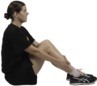
Starting position seated