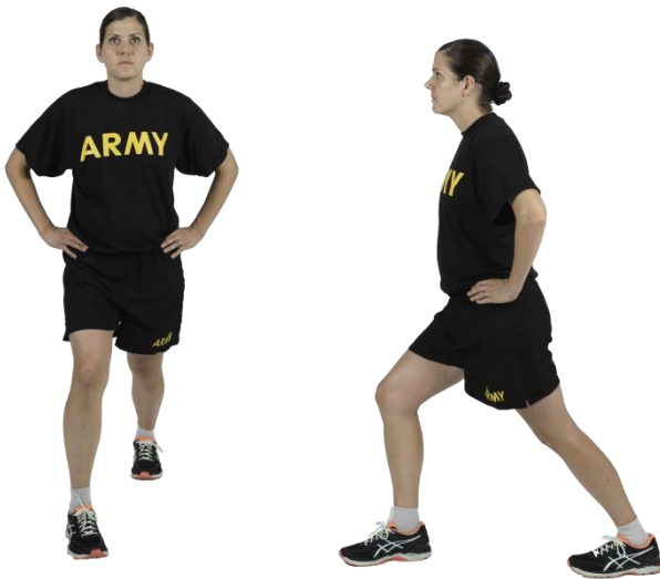
Stretch position 1