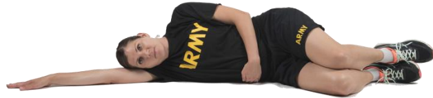
Count two & Count four

There is no modification for this exercise.