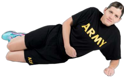
Modified Side Bridge Right Side Starting position