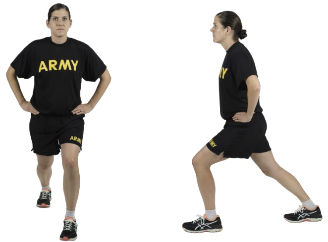
Stretch position 2