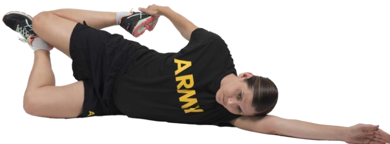
Stretch position – do both sides

Modify by keeping trunk on the ground for greater stability.