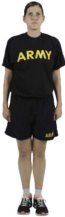
Standing Start Position at Attention