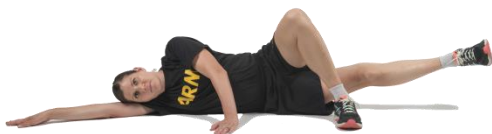
Count one & Count three