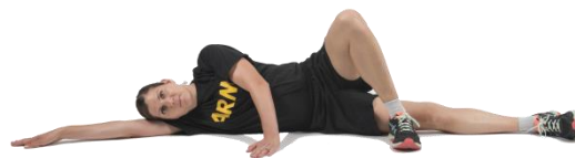
Count two & Count four

Modify body position so leg is in front to reduce stress on hip joint. May also lower trunk onto the ground for more stability.