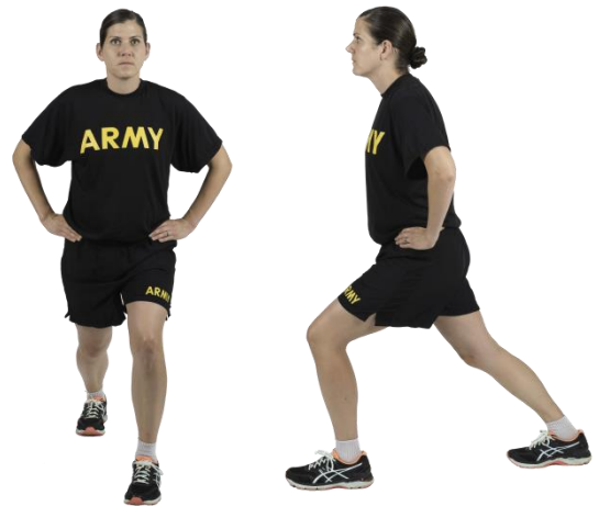
Stretch position 2