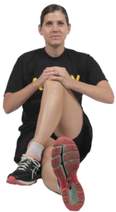
Stretch position 1