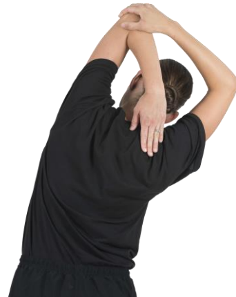
Stretch position 2

Modify by reducing lean of the upper body.