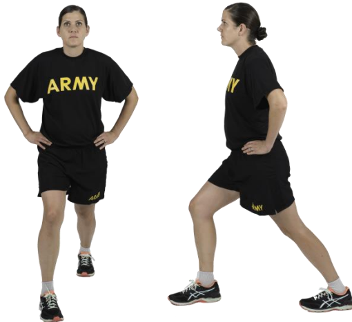
Stretch position 1