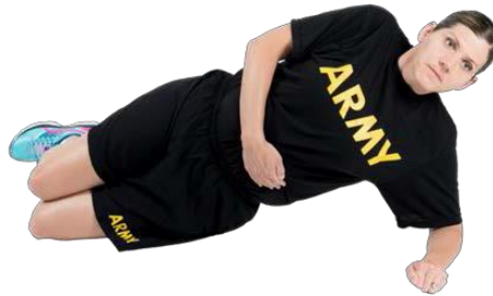
Modified Side Bridge Right Side Hold position

Modified Side Bridge is from the knees. Build up to holding balance position for 60 seconds. Start with 10 second increment holds, increasing to 15, then 20, then 30 second holds. Progress to holding for the full 60 seconds on each side.