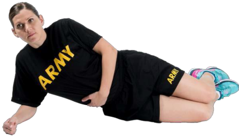
Modified Side Bridge Left Side Starting position