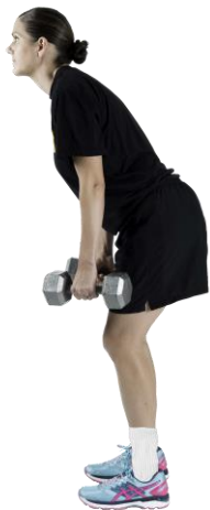
Bent-over Row Starting position