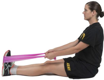
Shoulder Retraction Starting position