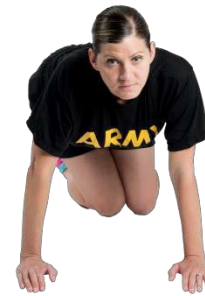
Stretch position 2

Alternate stretch is either the Hip and Back Stretch or the Hand and Knees Buttocks Stretch.