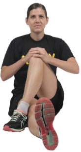
Stretch position 1