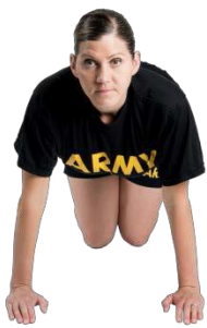
Hands and Knees Buttocks Stretch Starting position