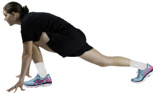
Count four – step back with right leg

Modify by stepping back and forth with alternating legs, rather than gliding quickly.